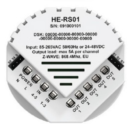
Figure 3: SmartStart QR Code & DSK

To add the HE-RS01 to a Z-Wave network using SmartStart: